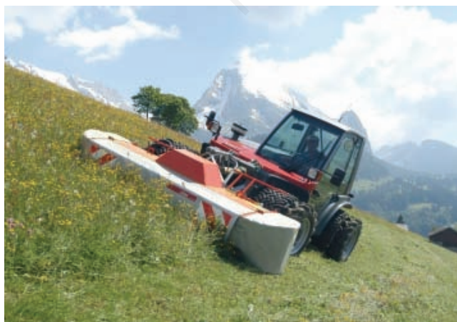
Figure 1. Hill-farm tractor (photo courtesy of Aebi & Co. AG Maschinenfabrik).

For the estimation (Eq. 2), the weighted ordinary least squares (OLS) approach is applied. The weights result from the iteratively reweighted least squares (IRLS) robust regression, which takes into account potential outliers. The Breusch-Pagan test is then used to analyse whether the variance of the regression residuals is constant.