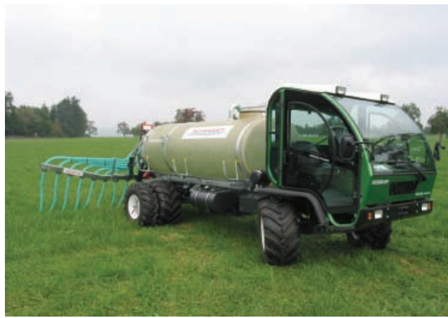
Figure 2. Transporter for upland mechanisation with mounted slurry tanker.

The survey asked farmers to give repair costs, including service agents' bills, for the last three years for each machine. The question-