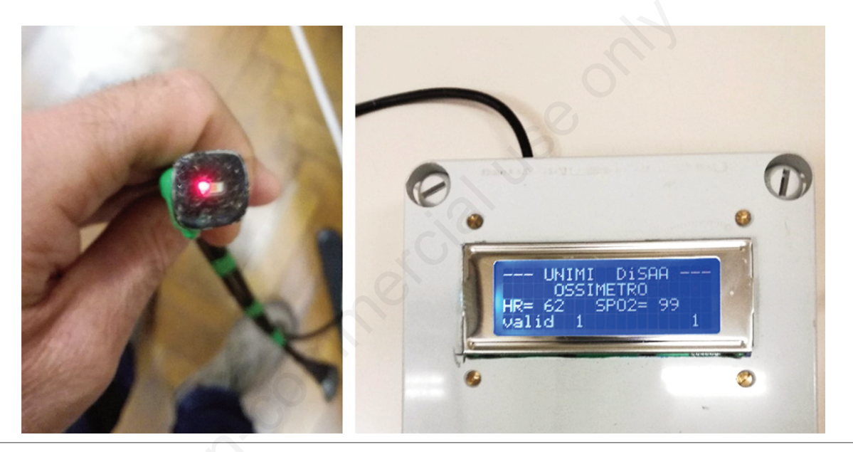
Figure 2. On the left: the pulse oximeter fixed at the top of a 50 cm-long flexible metal rod. On the right: the digital display.

fore subject to high mechanical stress due to the frictional force between the mouthpiece and the teat during the low-flow period toward the end of the milking session. Furthermore, from a practical point of view, since this sensor could be included in a monitoring system of the milking machine, this position ( i.e. on the liner mouthpiece) is the best solution to obtain a representative measurement of SpO<sub>2</sub> and heart rate, and facilitate the periodic maintenance activities, including cleaning. Finally, the acquisition time needed to obtain a stable reading was about five seconds.