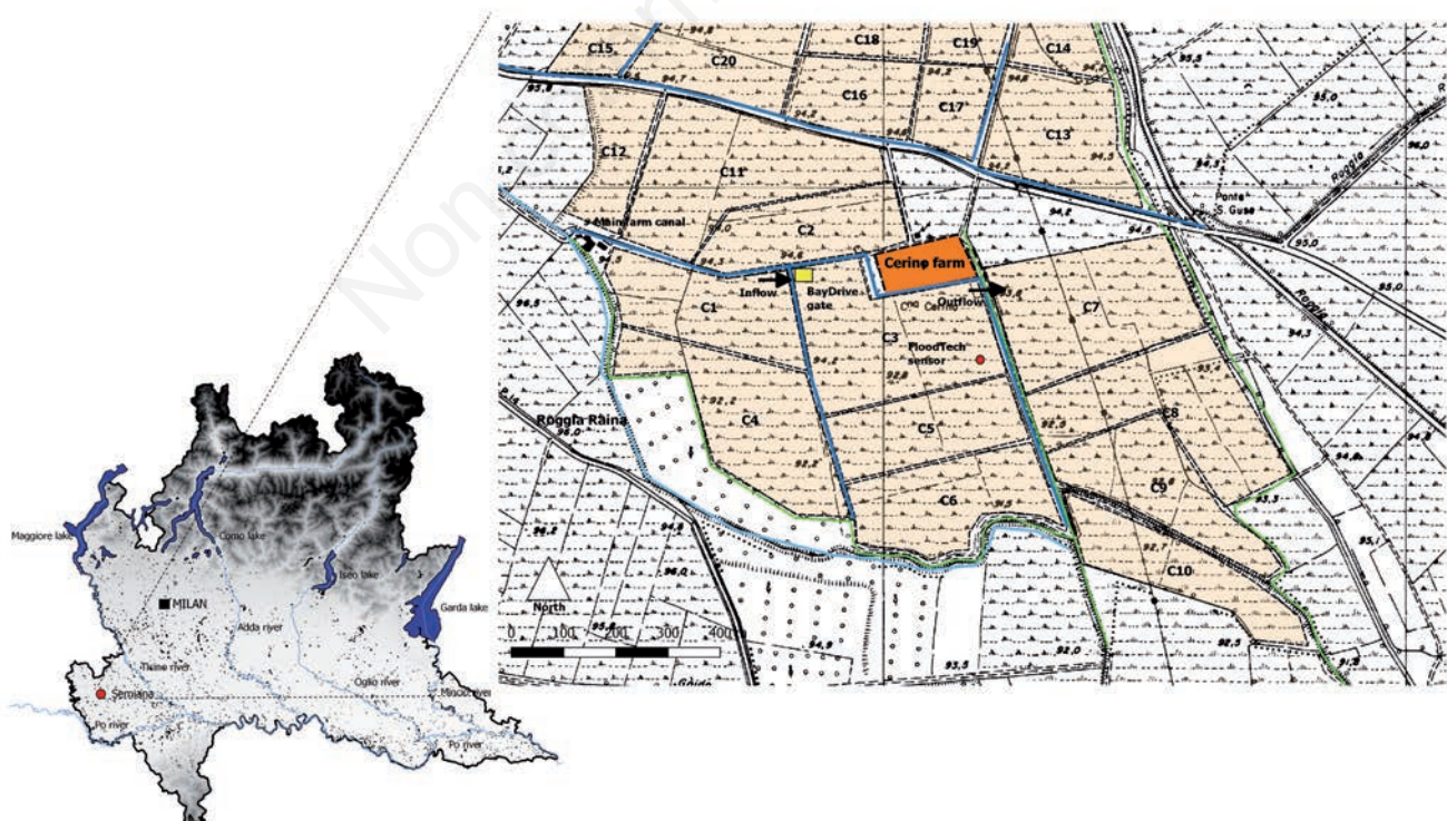
Figure 1. Cerino farm with bay-drive gate and water level sensor positions.

The Cerino farm property is approximately 100 hectares, subdivided into 20 fields with an average of 5 hectares. This high level of field fragmentation is typical of the Italian rural areas, which are also characterised by extensive networks of irrigation canals supplying water to each field and collecting the drained water. Irrigation canals are often indiscriminate since they are often used as drainage canals in which the drained water is mixed with irrigation water and delivered to downstream areas. At the farm level, water is diverted from the main farm canal through a series of sluices that the farmer opens and closes in sequence to obtain the