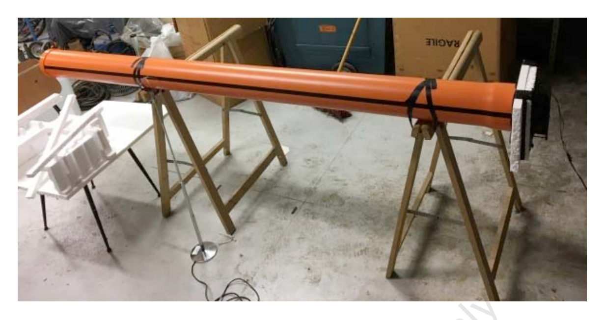
Figure A.3: Picture of the ventilation system during the construction and the measurements.