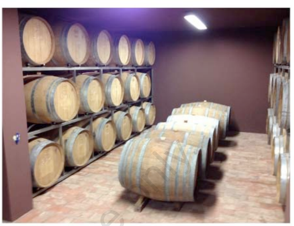
Figure A 1: Pictures of the wine cellar.