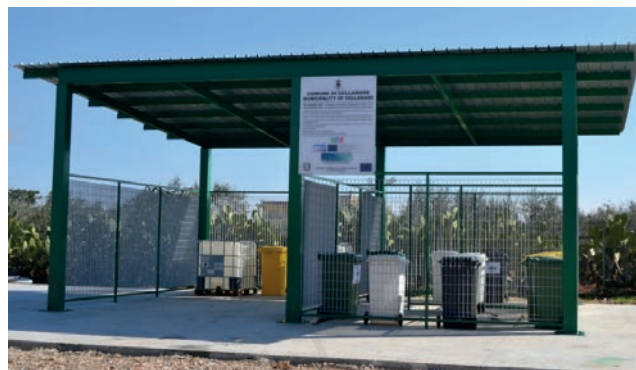
Figure 1. The AgroChePack pilot station at Cellamare (BA, Italy).

Two identical PE/PA pesticide bottles with a 0.75 L volume were subject to decontamination according to the triple-rinsing procedure (Figure 2) described in the Guidelines for small containers outlined as a result of the AgroChePack Project. The bottles