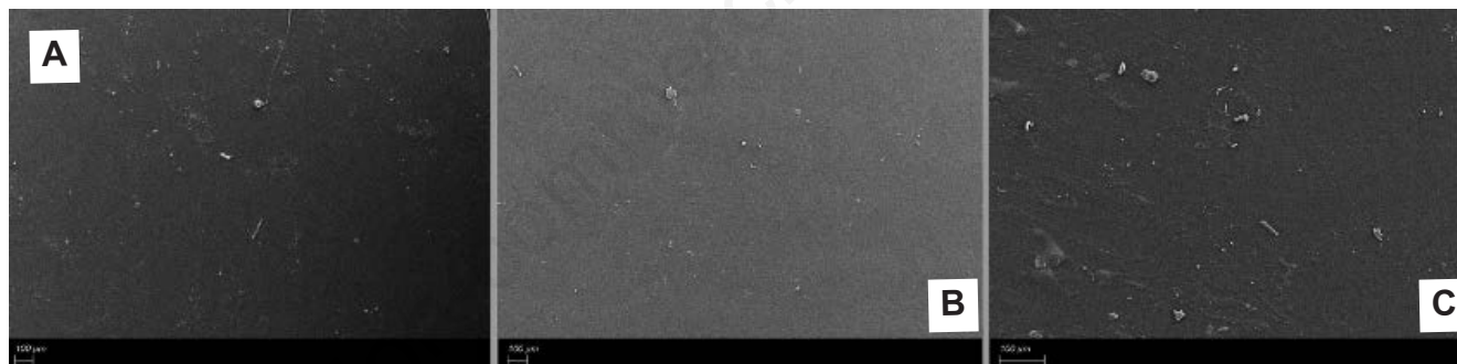
Figure 4. Scanning electron microscopy micrographs at 100X magnification. A) Not-aged sample; B) sample aged not in contact with pesticide; C) sample aged in contact with pesticide.

Triple-rinsing a plastic container much time after its emptying, or that has been partially used and which has remained too much time half-used, results in fact into the formation of hollows and into an increase of roughness of the polymer surface, as well as into the crystallisation on the empty internal side of the plastic container of chemical elements which are not removed, even through an appropriate triple-rinsing procedure. Although this does not pose direct risks to the environment, it can represent a hindrance to the recycling process of the APPW and, consequently, to the material's circularity.