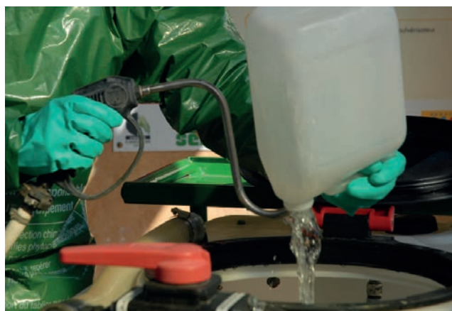
Figure 3. Triple-rinsing at the AgroChePack pilot station in Cellamare (BA, Italy).

According to the composition of the pesticide, the concentration thresholds for its hazardousness were evaluated on the basis of the Regulation n. 1272/2008 (European Parliament, 2008). The acute (short-term) toxicity in aquatic environment was evaluated for both mixtures of the not aged and of the aged APPW. The mixture contained in the not aged APPW had a LC 50 value of 9.83 mg/L and that in the aged APPW had a LC 50 value of 10.04 mg/L. According to the limits identified in the Regulation, no classification for acute toxicity was needed.