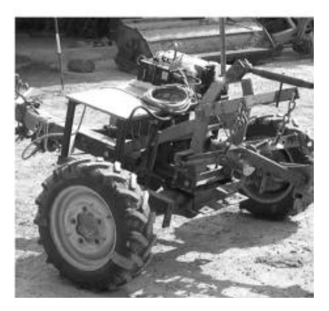
Fig. 1 - The tested hitch-cart.

The preliminary traction tests were performed using a single-furrow plough drawn by two horses (5 and 8 years old), of T.P.R. (Tiro Pesante Rapido, Fast Heavy Draught Horse) breed, weighing approximately 700daN. Five tests were carried out, each one ploughing a furrow 20cm deep by 25cm wide and 50m long. Draft was measured using a BLH strain gauge (model U3G1, Vishay Measurements Group GmbH, Germany) load cell (response: 3mV/V; F.S.: 50kN). The output of the load cell was connected with a data acquisition system based on a modular multichannel data logger (MCDR-M-128, Leane international, Italy) fitted to a laptop computer (MCDR128 acquisition software). The measuring system was calibrated before every test to avoid any possibility of error attributable to jerks. The same instrumentation was used for the hitch cart tests. In this case the two ends of the load cell were mounted through articulated eye joints between the hitch cart front bar and the rear hitch of a tractor. The tested hitch cart (Figure 1) is made up of an axle equipped with a differential gear box; on the axle a trapezoidal shaped chassis made with iron square section tubes was mounted.