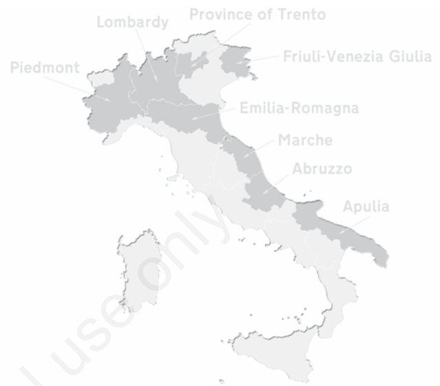
Figure 1. Location of the local administrations included in this study.

impacts are often based on indicators drawn from international guidelines (Abruzzo) and actions/components matrices (Emilia Romagna, Lombardy, and Trento). The authors of the SEA reports have directed the study to the assessment of at least two alternative scenarios, with