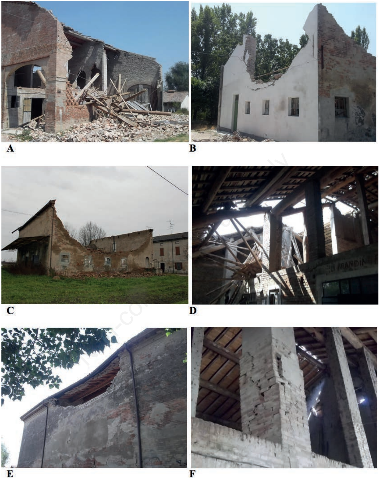
Figure 5. Main damages to building group A2. Example of catastrophic stable-hayloft collapses for: A) overturning of the façade (bldg. #1); B) out-of-plane vertical flexure (bldg. #18); and C) horizontal flexure mechanism (bldg. #10). D) Loss of support of the roof beams for the excessive deformations of the building (bldg. #4). E) Overturning of a limited portion of masonry panels for the horizontal force transmitted by the beam elements of a flexible roof (bldg. #1). F) Severe damage at the base of a slender masonry column (bldg. #4).