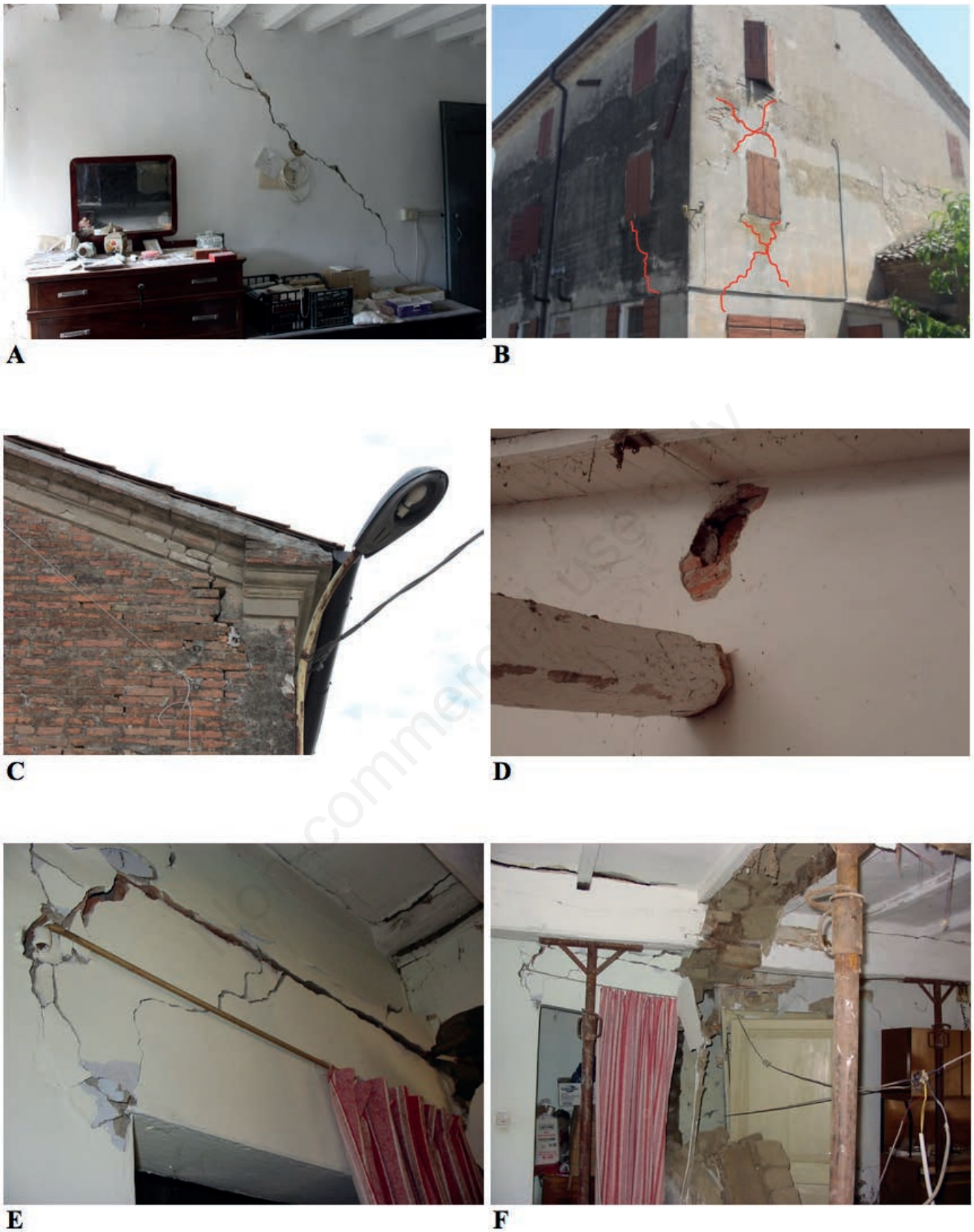
Figure 4. Main damages to building category A1. Example of in-plane damages induced by seismic force on: A) partition walls (bldg. #2); and B) structural walls (bldg. #6); C) cracking of corner between two orthogonal masonry walls (bldg. #1); D) loss of support of a wood beams from the masonry panels (bldg. #2); E) view of a lintel failed; and F) arch collapse (bldg. #20).