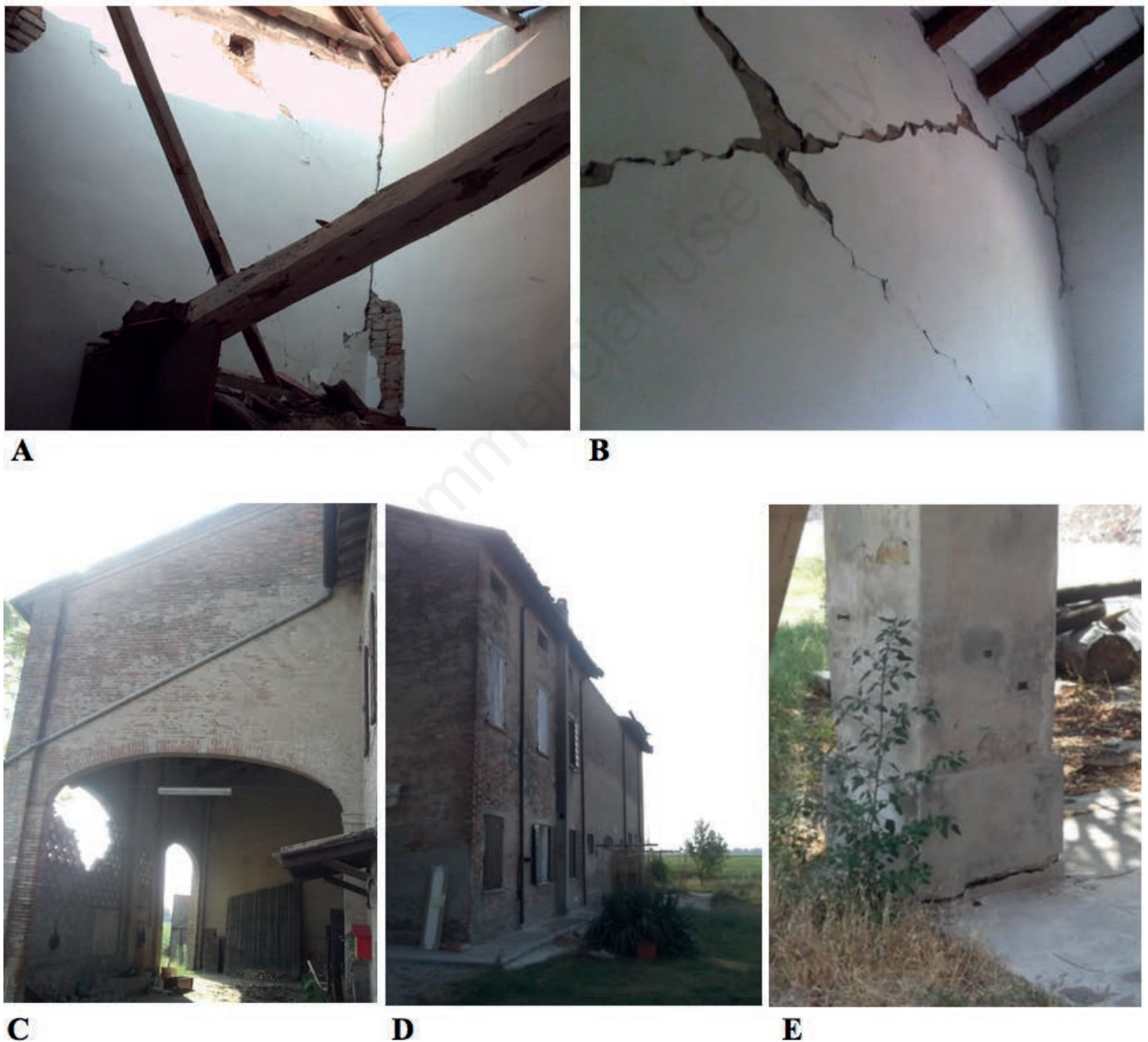
Figure 7. Particular of damages to category B buildings and non-structural elements. A) Fallen of timber roof beams from the intermediate wall in a composed building # 8. B) Corner opening between orthogonal walls poorly connected (bldg. #8). C) Failure of gelosie , typical holed infill walls (bldg. #5). D) Fallen of a portion of the perimeter masonry cornice (bldg. #5). E) Cracking at the base of a masonry column portico (bldg. #7).

ure or fall of these elements do not cause the collapse of the building, however they can represent a serious risk for people inside or close to the building. In Figure 7C and d two typical examples are showed. The first is related to the failure of non-structural ornamental elements like the gelosie (Figure 7C), typical holed infill walls widespread in northern Italy. The second refers to perimeter masonry cornice (Figure 7D) typically built with external good texture masonry and internally infilled by waste material and so with poor mechanical strength. These elements often represent the only building friezes, since the vernacular context usually is governed by simplicity. Lastly, as stated upon, in rural buildings it is quite common to find porticos and wooden sheds commonly sup-