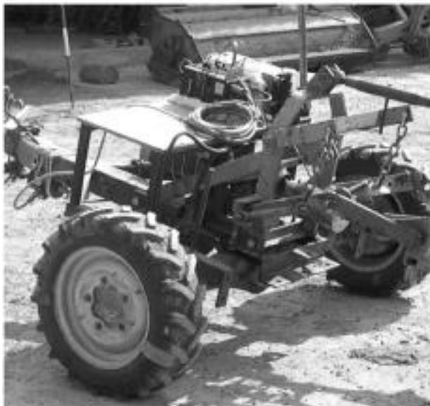
Fig. 1 - The tested hitch-cart.

The preliminary traction tests were performed using a single-furrow plough drawn by two horses (5 and 8 years old), of T.P.R. (Tiro Pesante Rapido, Fast Heavy Draught Horse) breed, weighing approximately 700daN. Five tests were carried out, each one ploughing a furrow 20cm deep by 25cm wide and 50m long. Draft was measured using a BLH strain gauge (model U3G1, Vishay Measurements Group GmbH, Germany) load cell (response: 3mV/V; F.S.: 50kN). The output of the load cell was connected with a data acquisition system based on a modular multi-channel data logger (MCDR-M-128, Leane international, Italy) fitted to a laptop computer (MCDR128 acquisition software). The measuring system was calibrated before every test to avoid any possibility of error attributable to jerks. The same instrumentation was used for the hitch cart tests. In this case the two ends of the load cell were mounted through articulated eye joints between the hitch cart front bar and the rear hitch of a tractor. The tested hitch cart (Figure 1) is made up of an axle equipped with a differential gear box; on the axle a trapezoidal shaped chassis made with iron square section tubes was mounted.