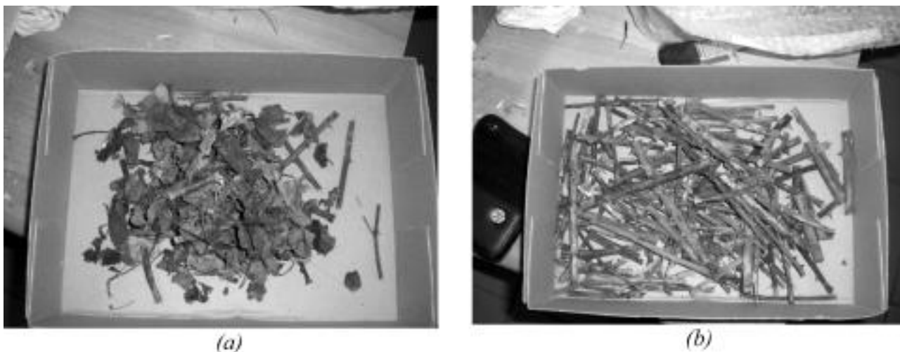
Fig. 1 - Samples of biomass before trials: (a) type C1 (branches and leaves); (b) type C2 (only branches)

The standards used in the trials carried out by the thermogravimetric analyzer for the determination of the moisture content, ashes and volatile content were CEN/TS 14774-1:2004 ( Solid biofuels - Methods for determination of moisture content - Oven dry method