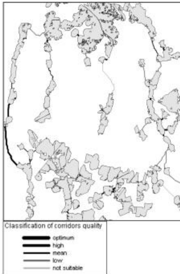
Fig. 4 - Map of Potential corridors and classification.

The values obtained for the quality of corridors, reported in Table 4, point out that the high or very high quality (62%) is associated with short corridors. Probably these are the connections between suitable areas in the North and in the South agglomerates of suitable area showed by the landscape model. 33% of corridors were characterised by a medium or low quality.