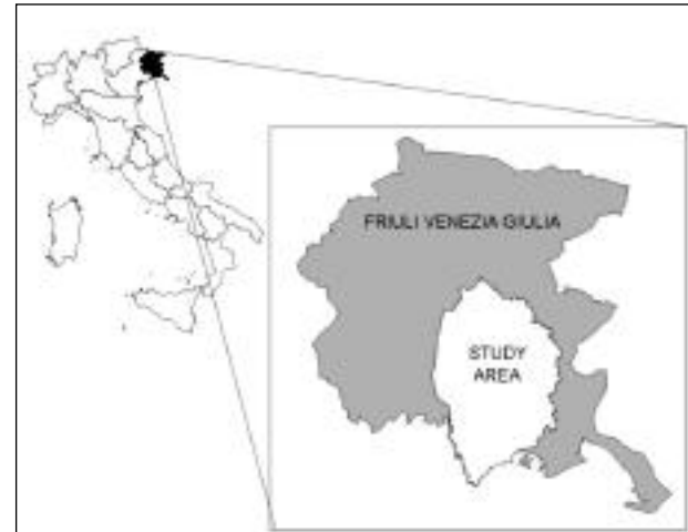
Fig. 1 - Study area.

along with the introduction of irrigation and agricultural land settlement) had a large impact on rural landscape simplification and on the intensification of agriculture [Bonfanti 1999].