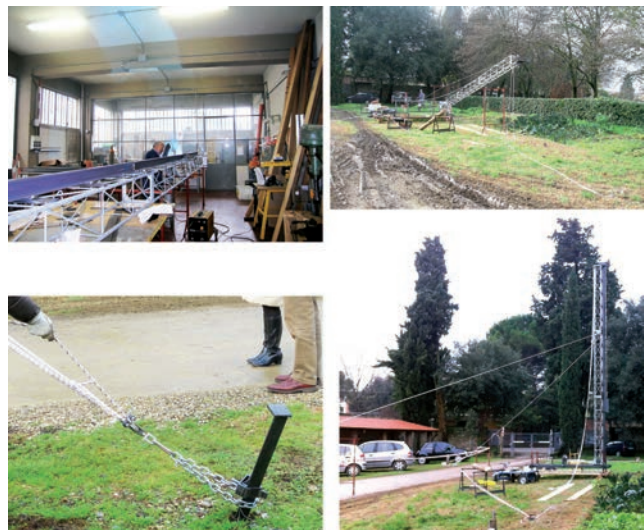
Figure 3. Pile driver under construction; uplifting; stays hooking system, and pile driver in working position.

The floating pier could not be built in Firenze because the shipping costs would have far exceeded the cost of construction. However, the extreme simplicity of the structure allows that it is made in-situ with ease and economy.