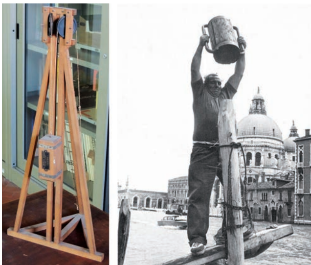
Figure 1. Pile driver model, owned by the GESAAF, and a present-day hand operated pile driver in Venice.

The 3 elements TR1, TR2, TR3, which constitute the truss, were constructed using prefabricated elements, to which the rail of the hammer stroke and the pulleys on the head have been applied. It was decided to use these prefabricated elements in order to reduce the process-