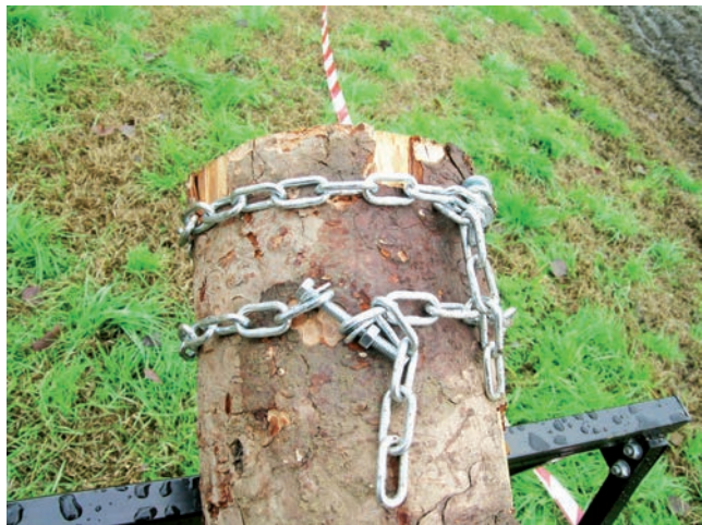
Figure 4. Pile head frettage.