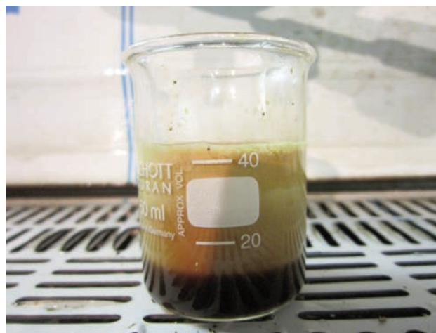
Figure 2. Caffè Firenze.